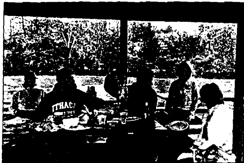
Upon arrival at the Fenner wind farm, we were greeted by local wind turbine sportsmen who already had dinner cooking. It was great to be met with such a warm welcome, especially as a storm threatened in the