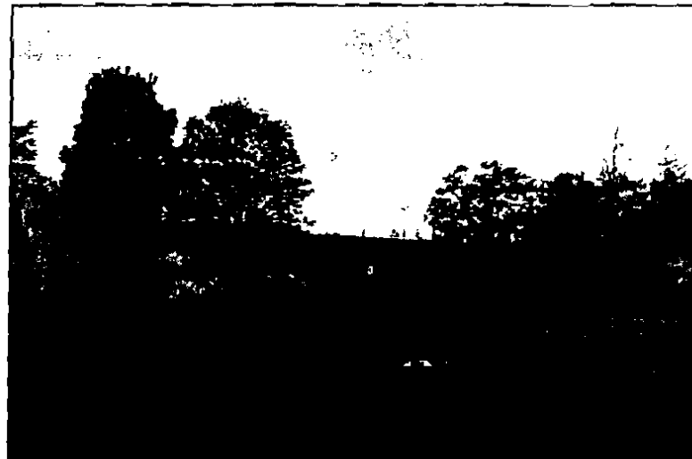
Like in scene from a fairytale, the clouds broke as the sun was setting, illuminating the Fenner turbines, and the landscape they sit on.