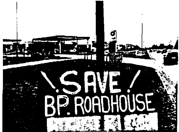
A BP Service Station in Melbourne, Australia running an astroturfing campaign to prevent closure by the government of Victoria. This campaign even involved a public protest. [1]

The goal of such a campaign is to disguise the agenda of a client as an independent public reaction to some political entity—a politician, political group, product, service or event. Astroturfers attempt to orchestrate the actions of apparently diverse and geographically distributed individuals, by both overt ("outreach," "awareness," etc.) and covert (disinformation) means. Astroturfing may be undertaken by anything from an individual pushing their own personal agenda through to highly organized professional groups with financial backing from large corporations, non-profits, or activist organizations.