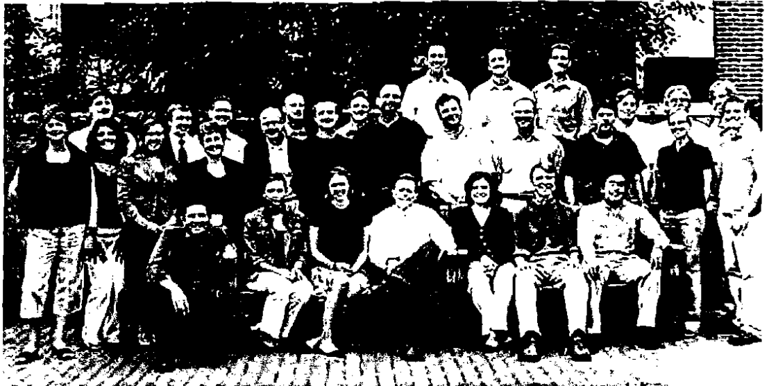
The Community Energy Team