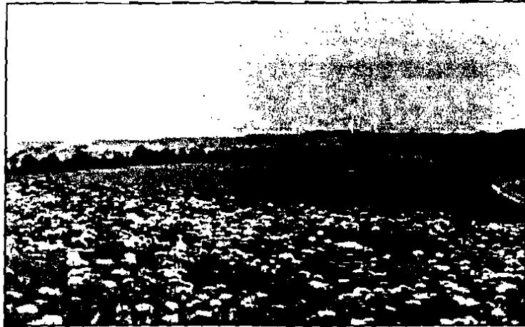
The Madison wind farm can be seen behind us, from dandelion hill, on one of our pit stops.