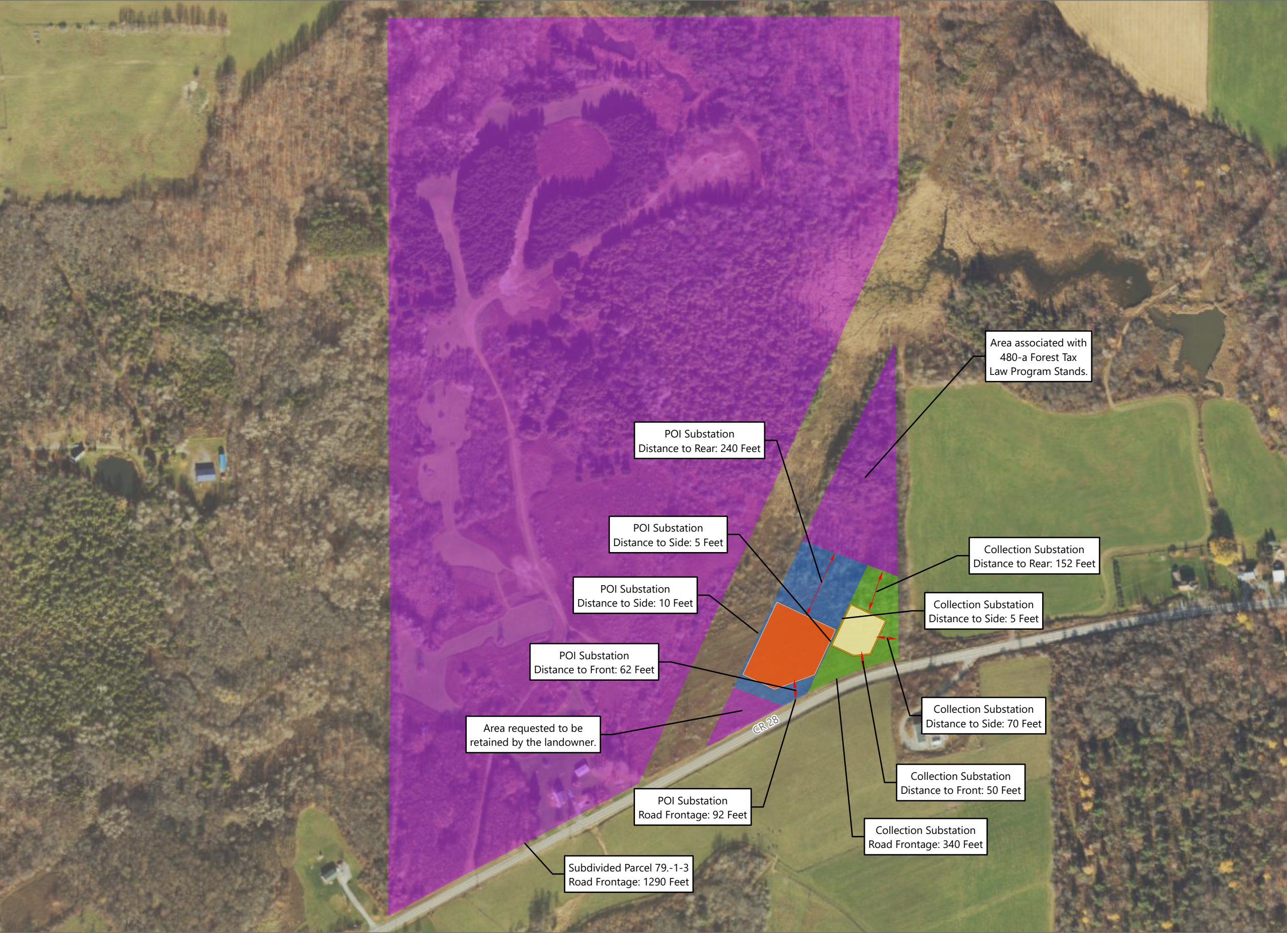
Figure 24-3. Substation Subdivision Setbacks

Towns of Eaton, Fenner, Nelson and Smithfield, Madison County, New York