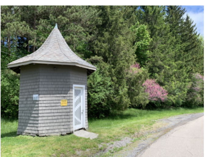
Gatehouse, view northeast