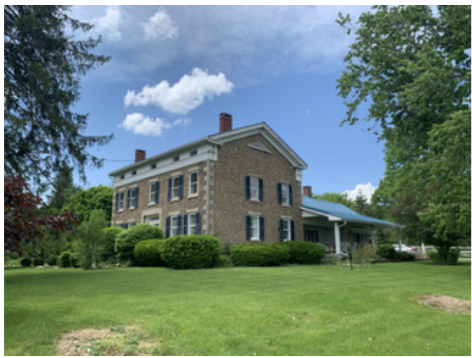
South and east elevations