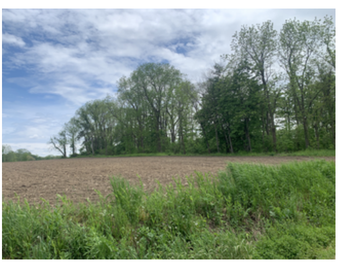
View east View southeast