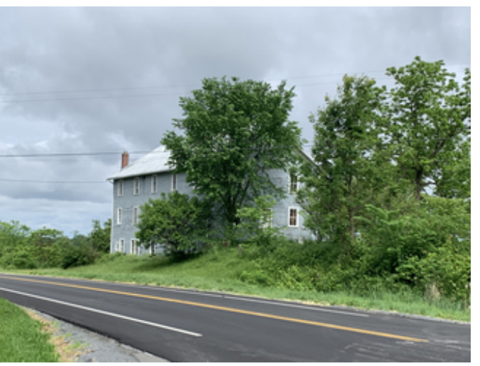
South and east elevations