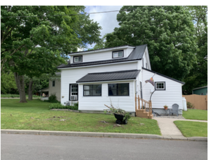
View southeast View east