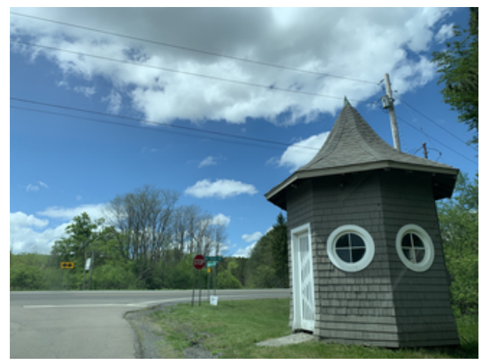
Gatehouse, view west