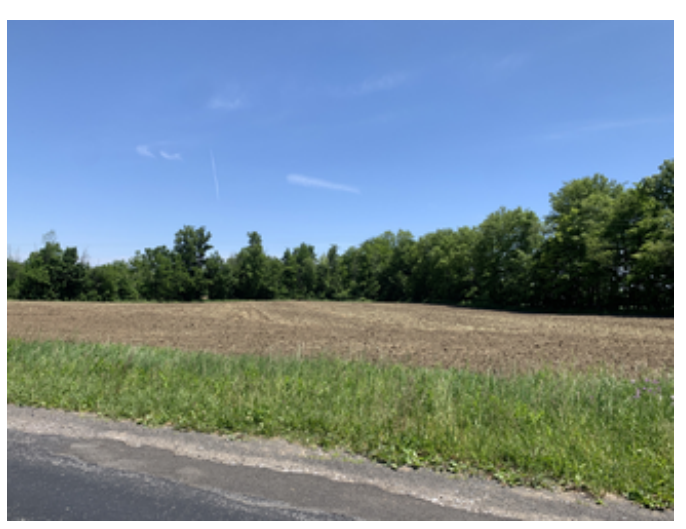
View east View east