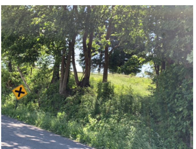
View west View southwest