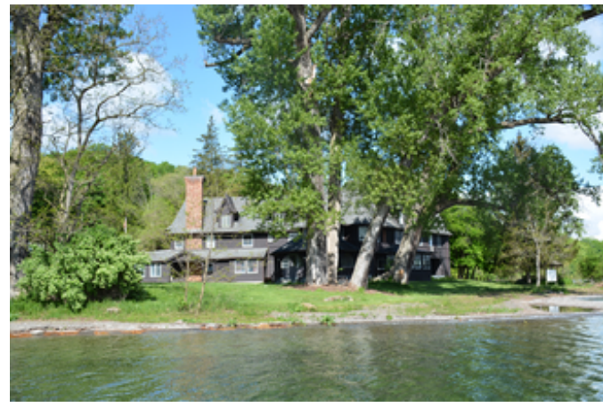
Galilee, view west