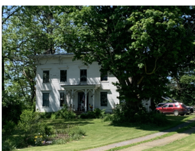
View north (2) View north