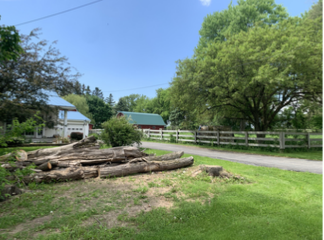
View northwest towards carriage barn