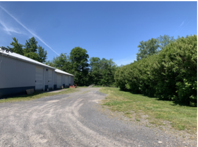
View west View west