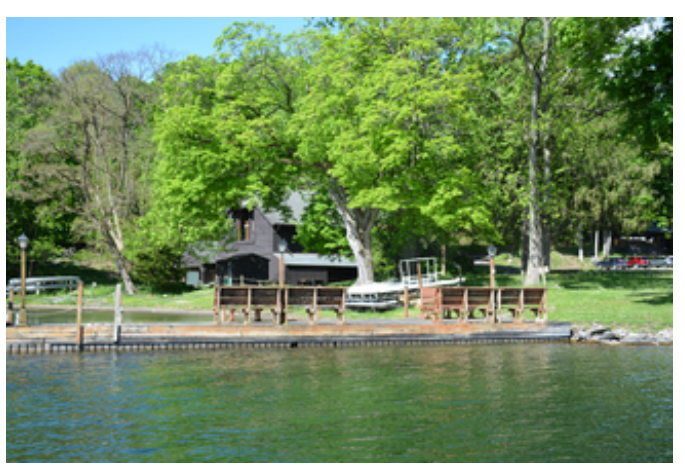
Dock and chapel, view southwest