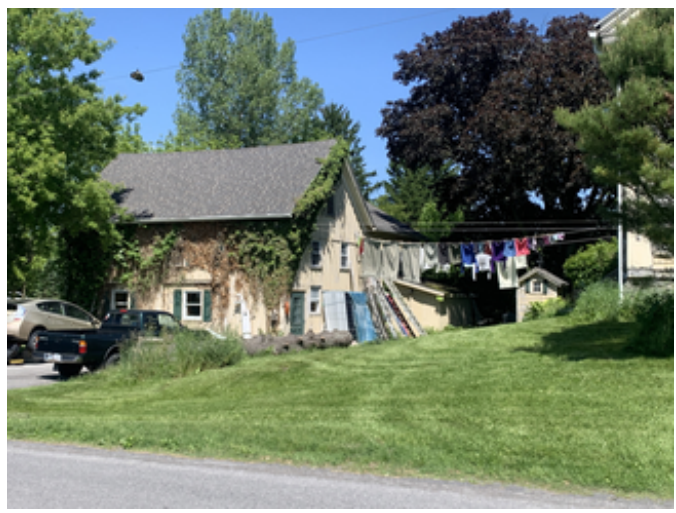
Carriage house, view northeast