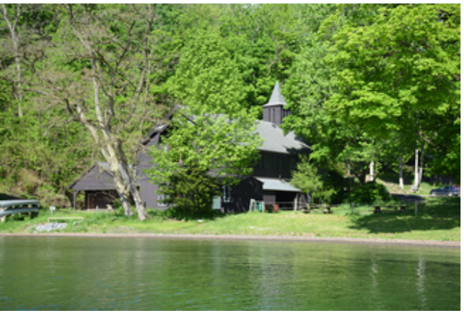
Chapel, view west