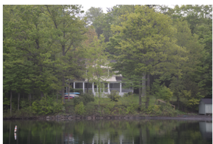
View northeast View east