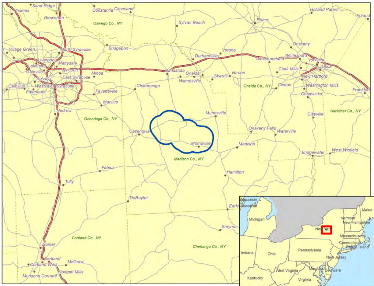
Figure 1: Counties that intersect the AOI

Our mobile phone analysis was performed using Comsearch's proprietary carrier database, which is derived from a variety of sources including the Federal Communications Commission (FCC). Since mobile phone market boundaries differ from service to service, we disaggregated the carriers' licensed areas down to the county level. Then we compiled a list of all mobile phone carriers in the main counties that intersect the area of interest. The area of interest (AOI) was defined by the client and encompasses the planned turbine locations. A depiction of the Project Area and counties appears below.