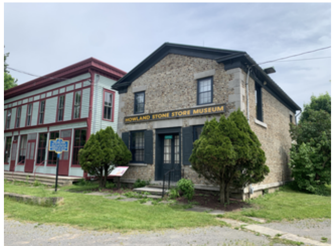
West and south elevations

Disclaimer: The Trekker data on this form has not yet been reviewed or approved by NYS OPRHP staff.