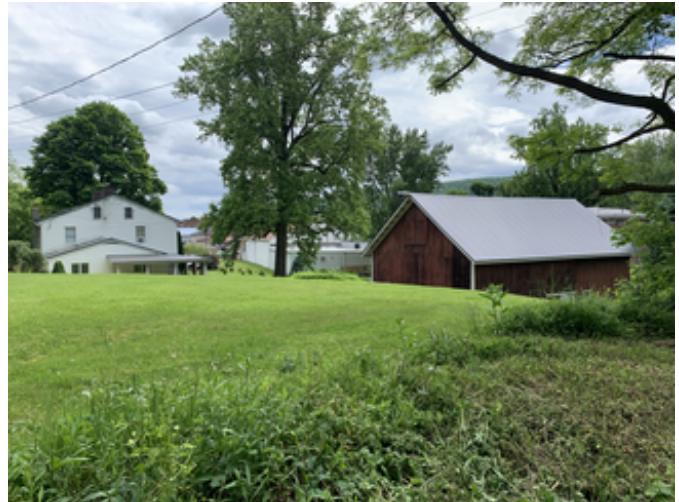
View south (2)