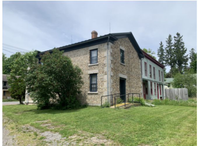
South and east elevations