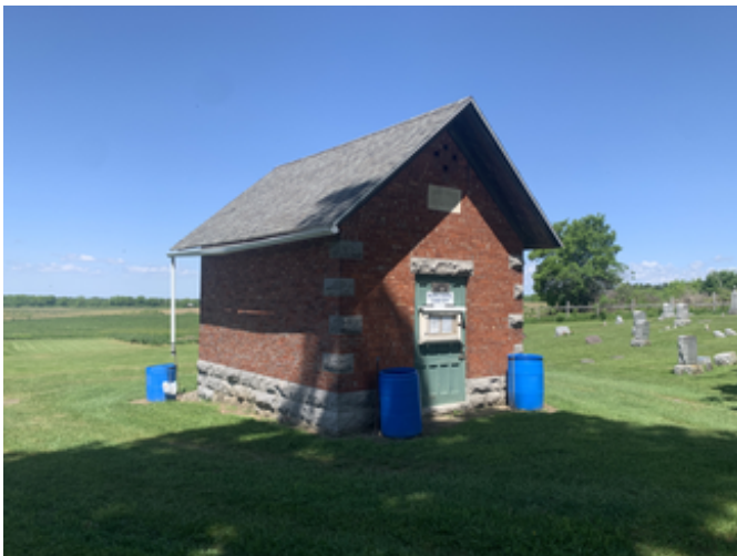
Vault, view northwest