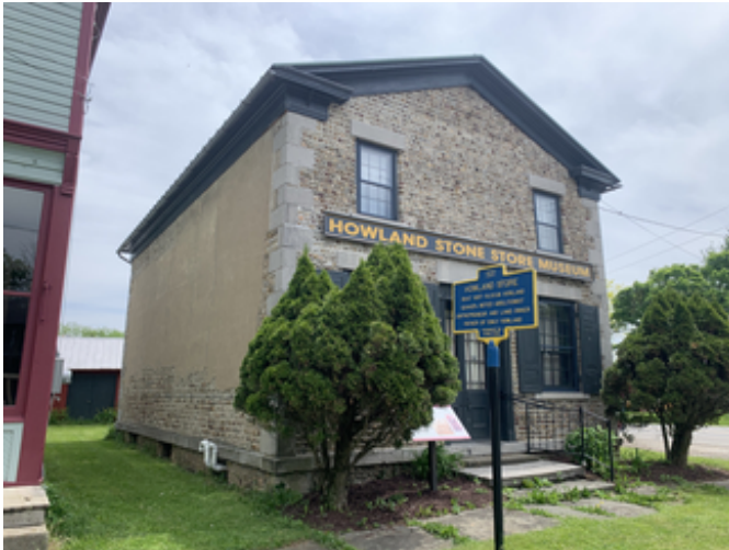
North and west elevations