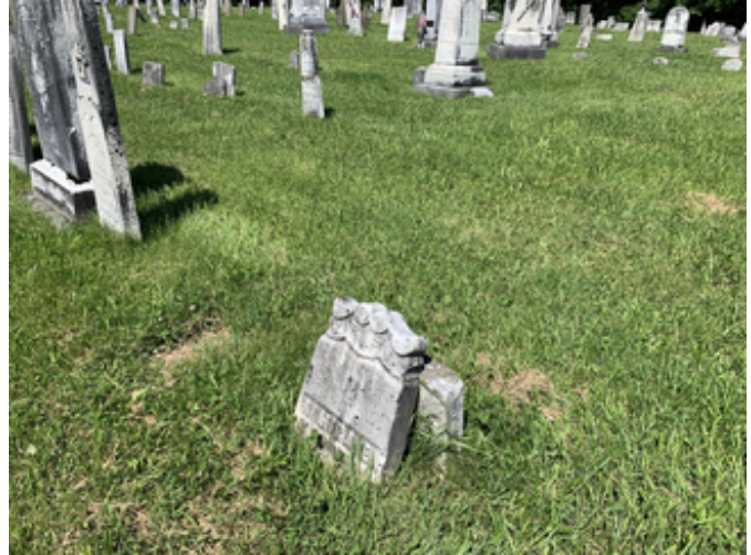
Burial marker example