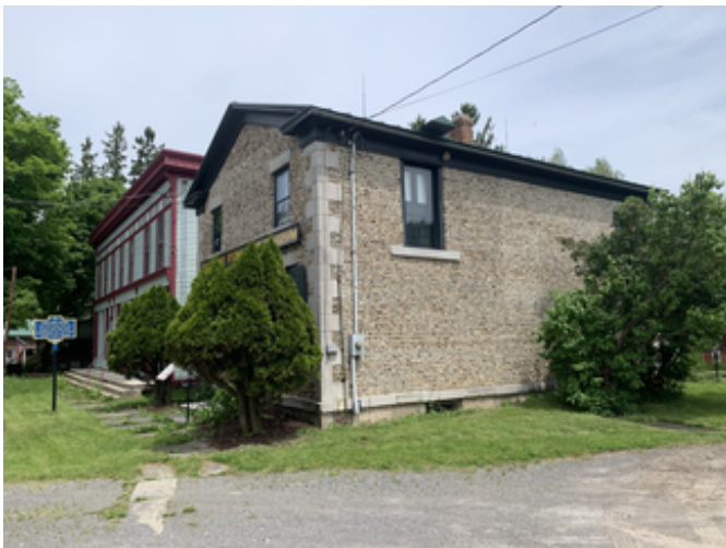
West and south elevations