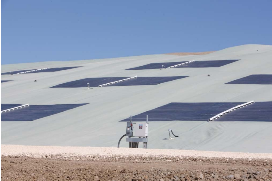
Figure 7. Flexible PV laminates on the Tessman Road Landfill near San Antonio, TX