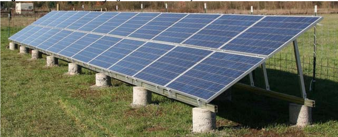
Figure 1. Fixed tilt A-frame style ground mounted PV system

In Figure 1 , the aluminum support stanchions supporting the PV panels can be seen on the right. The aluminum stanchions are secured to pillar-shaped ground penetrating concrete footings in the front and rear. The preceding discussion is relevant to PV solar systems. Comparison of PV systems to alternate solar technologies is discussed in further detail in the following section.