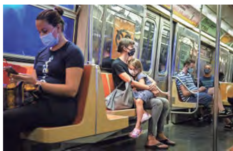
A child rests on a subway car last week while riders wear protective masks because of COVID-19 concerns in New York.

Employees, volunteers, students, teachers and in some cases, customers or attendees must be routinely screened for COVID-19 symptoms and exposure.