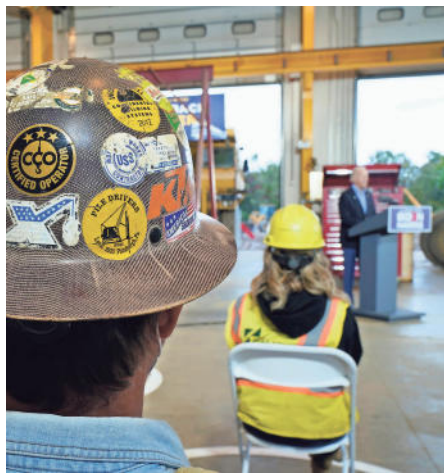
Then-Democratic presidential candidate Joe Biden, far right, speaks after touring International Union of Operating Engineers Local 66 in New Alexandria, Pa.

JEANNETTE, Pa. — When Joe Biden visited this corner of southwestern Pennsylvania in the final weeks before the election, his goal wasn't to win it so much as to show the area's overwhelmingly white working-class electorate that his party was at least willing to try. "A lot of white, working-class Democrats thought we forgot them," Biden said after touring a union training facility during a late September swing through Westmoreland County. "I get their sense of being left behind."