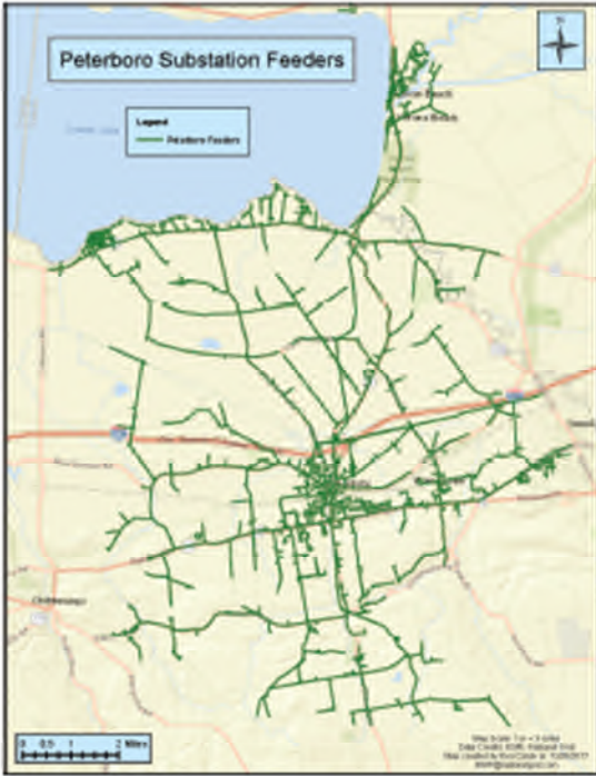
PETERBORO STATION - CANASTOTA, NY 13032