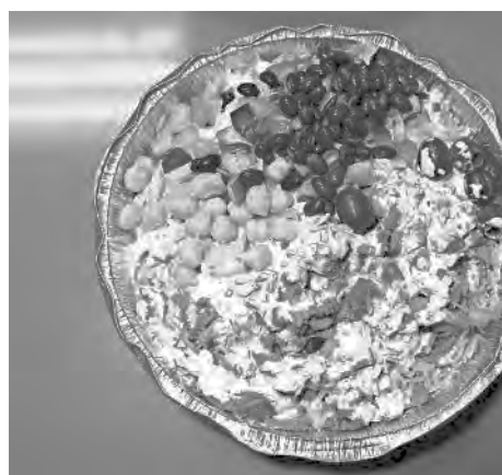
The Chicken NYC Halal Platter at the new Halal N Out. SHAWN DOWD/ROCHESTER DEMOCRAT AND CHRONICLE

SHAWN DOWD/ROCHESTER DEMOCRAT AND CHRONICLE