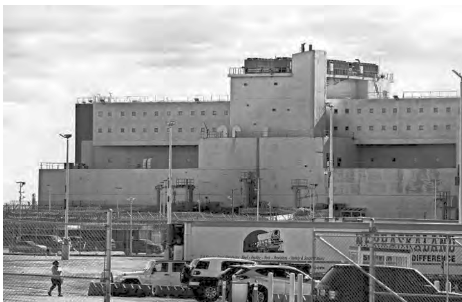
The Vernon C. Bain Correctional Center in the Bronx borough of New York is a five-story jail barge that stretches the length of two football fields.