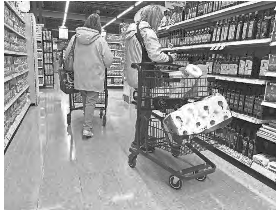
A former employee of the Webster Wegmans admitted in federal court earlier this year to creating fraudulent pharmacy refunds and then pocketing the money.

that she was in dire need of money because of a young son who faced serious health issues.