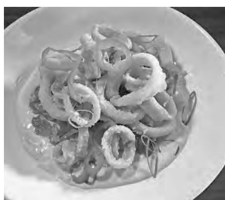
Crispy Calamari with pickled peppers and smoked paprika at Public Provisions in the Rochester Public Market.

fers spirits blending and cocktail classics. Food service is limited to Sunday; food destinations within walking distance are Mullers Cider House, The Revelry and Tony D's.