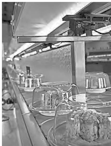
Umair Revolving Sushi, 2833 Monroe Ave., Brighton, is the area's first conveyor-belt sushi restaurant.

1344 University Ave., Rochester; (585) 730-4512; blackbuttondistilling.com. In 2013, when Black Button Distilling became the first craft distillery to open in Monroe County since Prohibition, its entire footprint totaled 5,000 square feet. This year, it opened a new, 28,000-square-foot location, more than quadruple the size of its original space on Railroad Street. It serves its own spirits (do try its best-selling bourbon cream) as well as beers, ciders and wines from local producers. It also of-