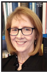
TINA WINSTEAD LIBRARY CORNER

provides tools to protect finances, invest wisely, grow wealth, and learn more about finances. Weiss provides independent and unbiased ratings for things like life and annuity insurers, property and casualty insurers, HMOs and health insurers, banks, stocks and stock mutual funds.