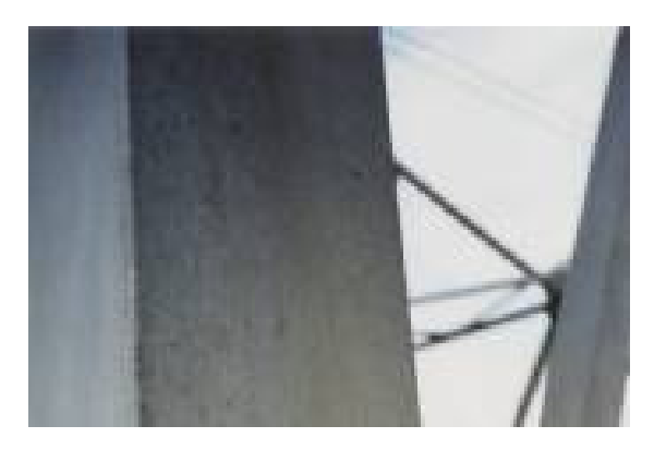
Visual Rating 1 – Serviceable Fully painted – overcoat and undercoat intact Fully galvanized – coating intact