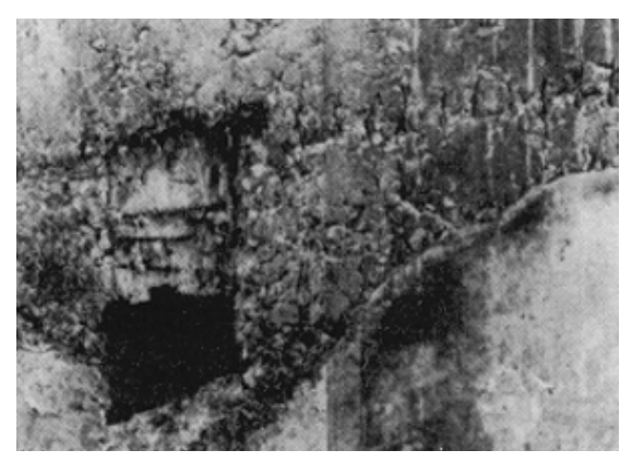
Honeycombing Construction faults, poor workmanship