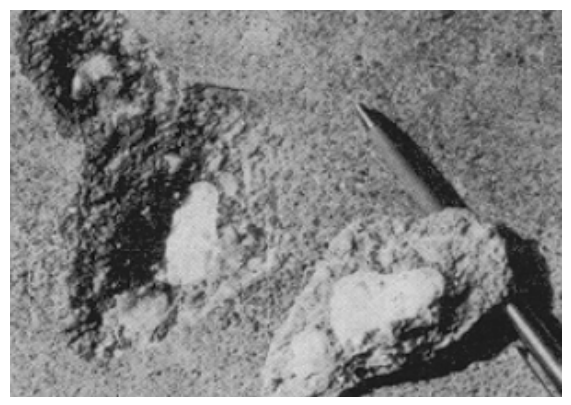
Spalling Development of fragments

Delamination Degradation of steel/concrete interface