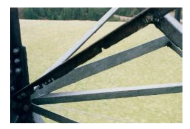
<u>Visual Rating 6 – Very Severe Deterioration</u> Perforated Element – severe physical damage