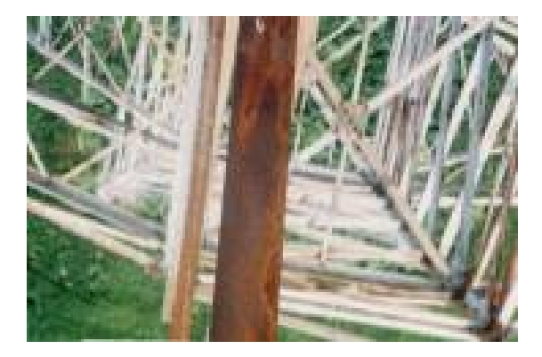
<u>Visual Rating 4 – Light Pitting</u> Some very light edge roughening. Loss of greater majority of coating and zinc layers. Corroded surface would dominate surface preparation – remedial action using wire brush, scraper and brushed paint not sufficient to give greatly increase life