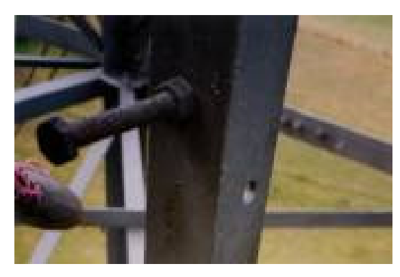
<u>Visual Rating 2 – Intact</u> Paint coating over all surface – overcoat may not be intact and some very small areas (<1%) of light corrosion may be present. Galvanizing intact except for some very small areas (<1%) of light corrosion