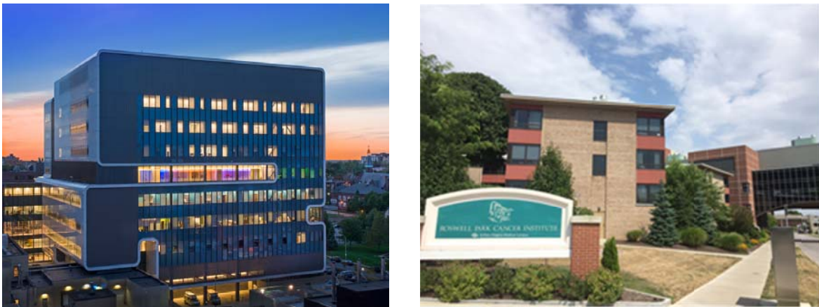
Image 1.2 – Images of Kaleida Health (left) and the Roswell Park Cancer Institute (right), members of the BNMC

If successful, the DSP will create new revenue streams for both the DER owners and National Grid, and meet the other New York REV objectives as stated in the Track One Order. The DSP could then be extended across National Grid’s service territory.