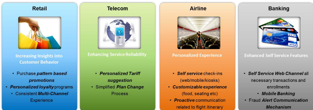
Figure 1: Customer Experience Industry Trends

Taking all of this into consideration, CenHub is not only Central Hudson’s response to the REV Track 1 order but also a leap forward in providing excellent service, choice and empowerment to all of its residential customers. CenHub extends the existing Central Hudson digital presence to increase customer self-service, insight and inspire action. Within CenHub, customers are offered an extensive list of functionality including but not limited to: