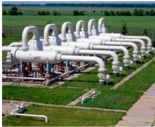
Natural gas pipelines