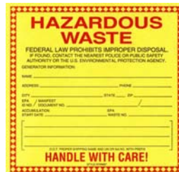
Hazardous Waste Label