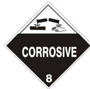
DOT Class 8 Label (Corrosive)