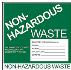
Non- Hazardous Waste Label