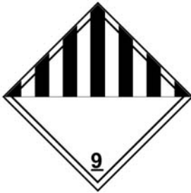
DOT Class 9 Label (Miscellaneous)