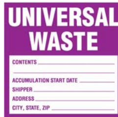
Universal Waste Label