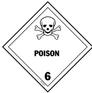
DOT Class 6 Label (Poison)