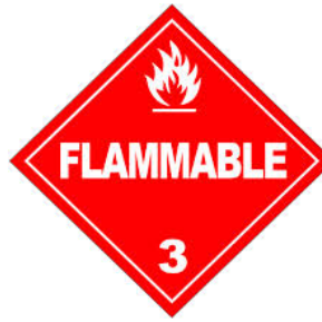
DOT Class 3 Label (Flammable)