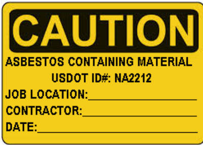
Asbestos Caution Label