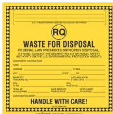
RQ Waste for Disposal Label