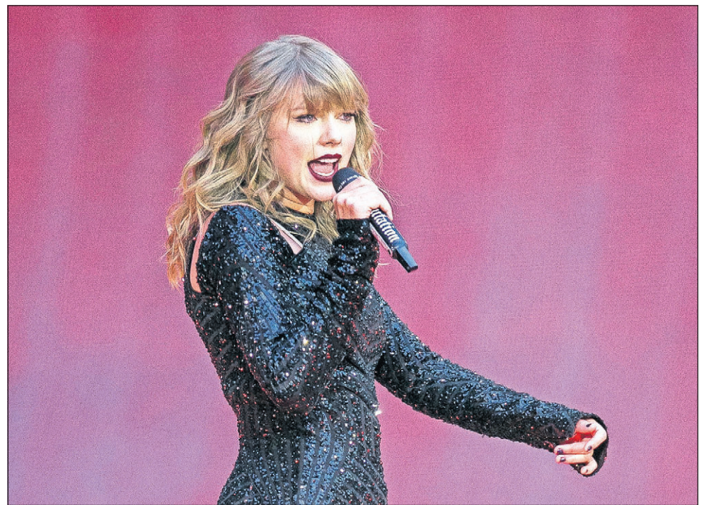
In this June 22 photo, singer Taylor Swift performs onstage at a concert at Wembley Stadium in London.

Mon. - Fri. 10 - 7; Sat. 10 - 4 19 MAIN ST. • WALDEN, NY 845-778-7692