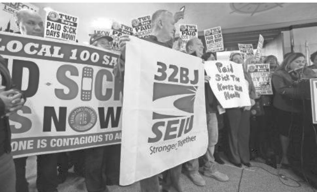
Union officials and Westchester County legislators held news conference in 2017 backing a paid sick-time law.