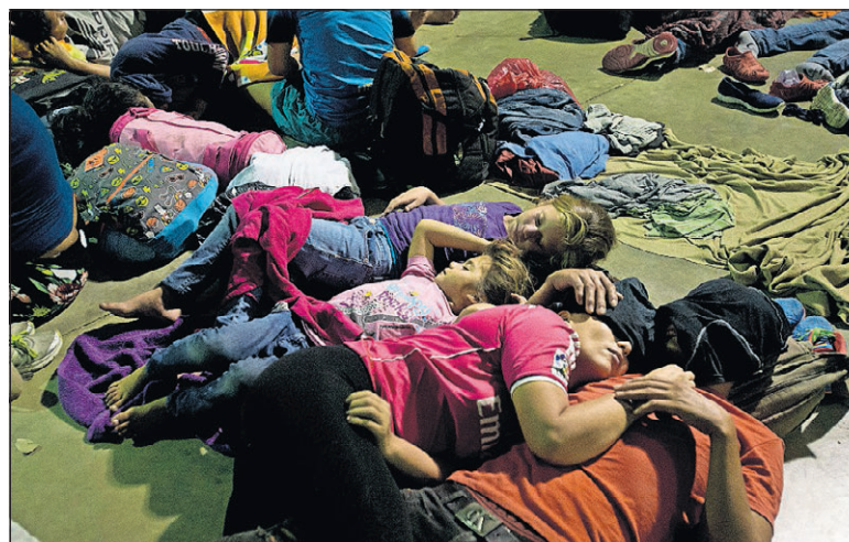
Honduran migrants sleep at an improvised shelter Monday in Esquipulas, Guatemala.

However, the Central American nation's ability to do anything at this point appeared limited as the migrants had already crossed into Guatemala on Monday, twice pushing past outnumbered police sent to stop them — first at the