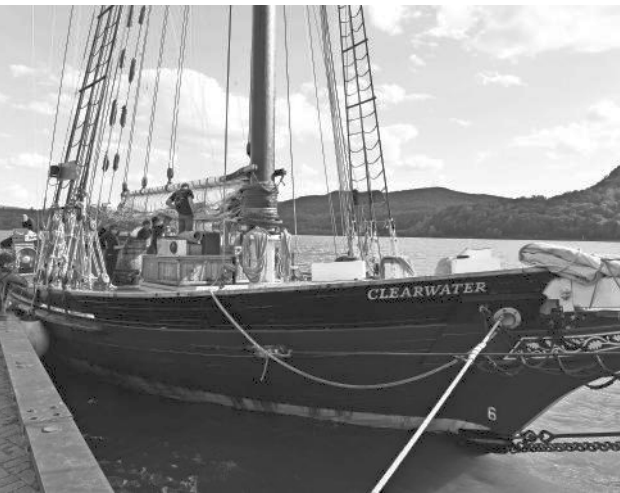
The sloop Clearwater docked in Cold Spring