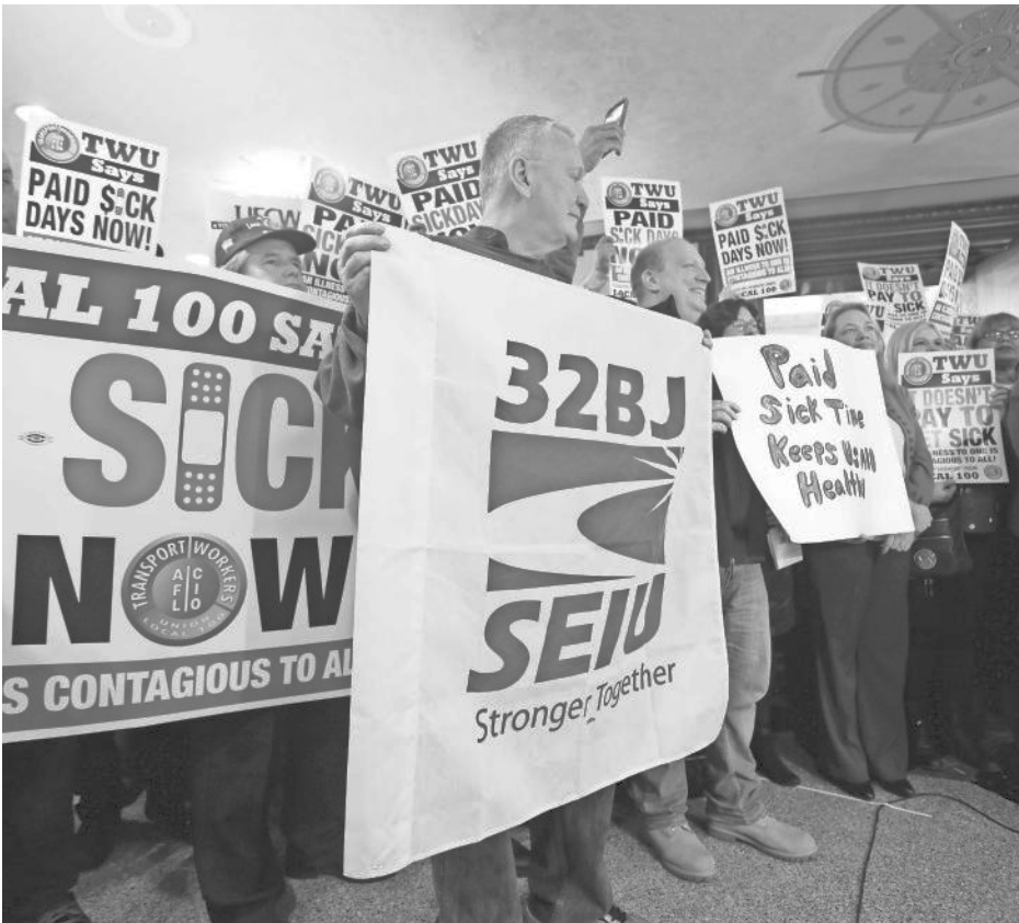
Union officials and Westchester County legislators announced legislation that would mandate employers provide workers with at least five paid sick days annually during a news conference at the county office building in White Plains. The bill will affect an estimated 123,000 workers in the county.