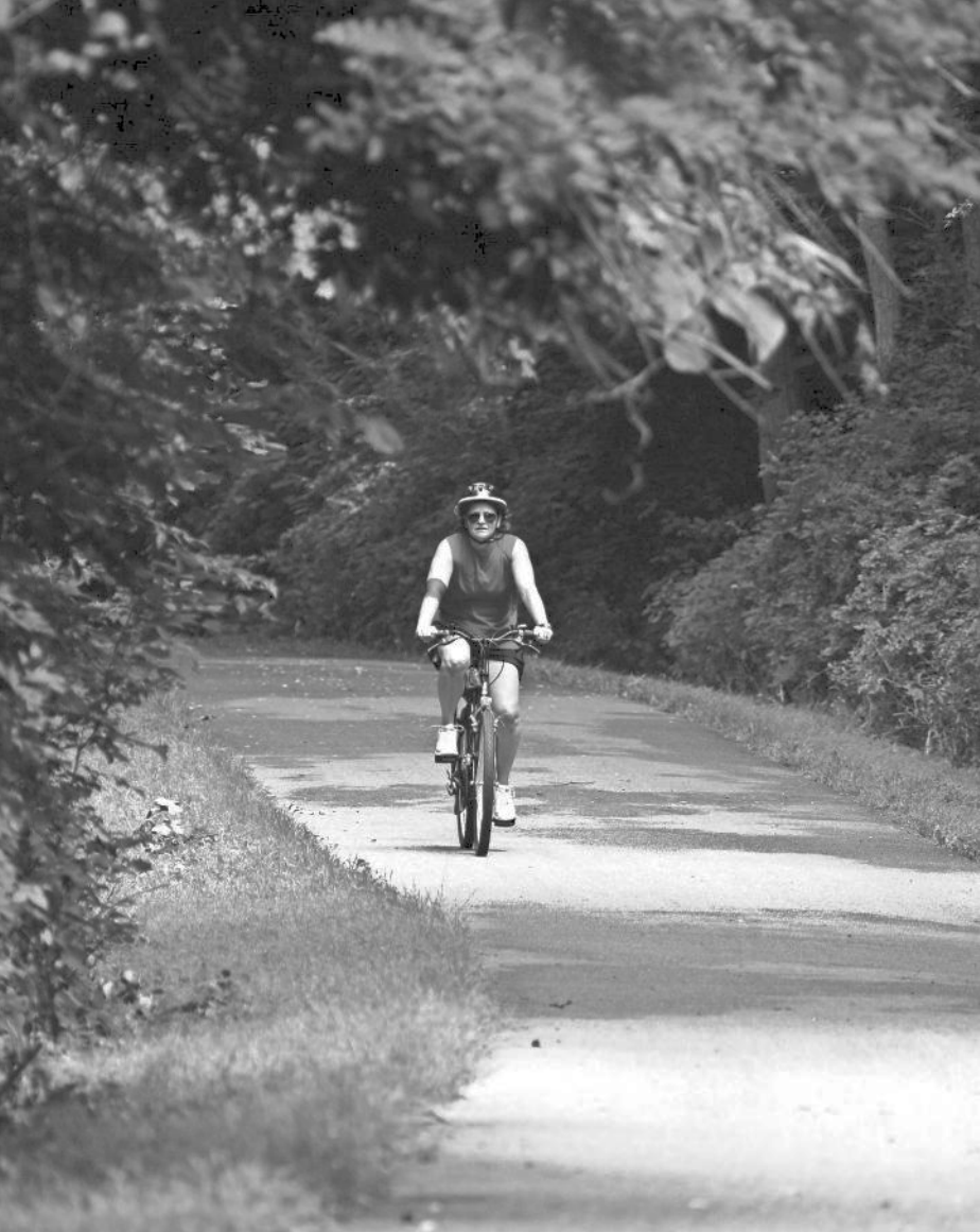
The North County Trailway in Yorktown runs 20 miles from Putnam County to Eastview.