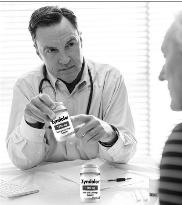
SAFE JOINT PAIN RELIEF: Doctors are recommending Xyndolor a new joint pain relief pill to patients after it has safely reduced discomfort in patients with even the most severe cases of back, finger and knee pain.