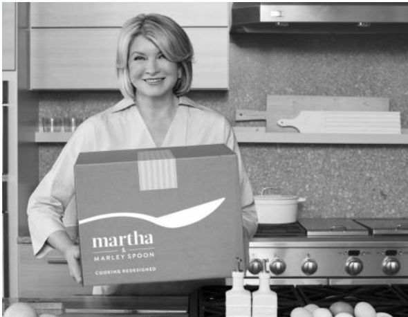
Fast-growing Martha & Marley Spoon is shipping thousands of meals every week to hungry customers across the country.

For the next 48-hours, readers in New York get 3 free meals and free shipping