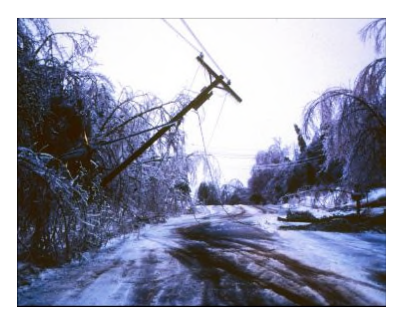
Image 1.1 – Photo of upstate New York after the 1998 Ice Storm<sup>1</sup>

Under the New York Public Service Commission's ("PSC") Reforming the Energy Vision ("REV") proceeding, this Community Resilience Demonstration Project (the "Project") consist of developing financial and engineering plans for a community microgrid that, once constructed, improves the local resiliency during severe weather events in the remote Village of Potsdam ("Potsdam") in upstate New York. Potsdam and surrounding St. Lawrence County have experienced multi-day power outages as a result of microbursts and winter ice storms; most notably the "Ice Storm of 1998" which left over 100,000 customers without power for up to 3 weeks in the North Country and recently, in December of 2013, another ice storm isolated over 80,000 customers for several days.