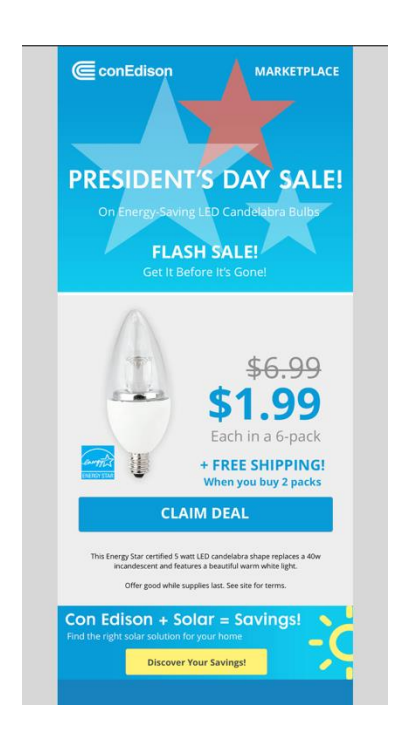
Lighting promotional email

Leading up to and after President's Day the Project team ran a series of promotions featuring a TCP LED Candelabra. The promotions were run primarily by email. More than 14,000 units were sold during the promotion, delivering an estimated energy savings of 588,432 kWh. The email also included a promotion for solar at the bottom, which drove 47 new solar leads.