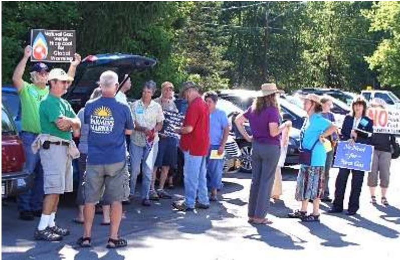
West Dryden Residents Against The Pipeline rallied outside the fire station, then came in to ask questions

Ellis says the pipe will be beneficial to homeowners along the route because it will enable them to hook up, which is free for homes that are within 100 feet of the pipe. A NYSEG handout shows that at current prices annual estimated residential energy costs are $1,061 for natural gas users compared to between $2,725 and $2,897 for fuel oil, electricity and propane users.