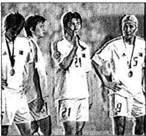
Chinese players look dejected after receiving silver medals in the final match against Japan in the Asian Cup soccer tournament Aug. 7 in Beijing.

Among many observers, however, the biggest lament is the national association's failure to implement a strong youth program to develop more homegrown talent. That's especially important because most of the heroes of the 2002 campaign, including former Everton midfielder Li Tie and striker Hao Haidong, are in the twilight of their