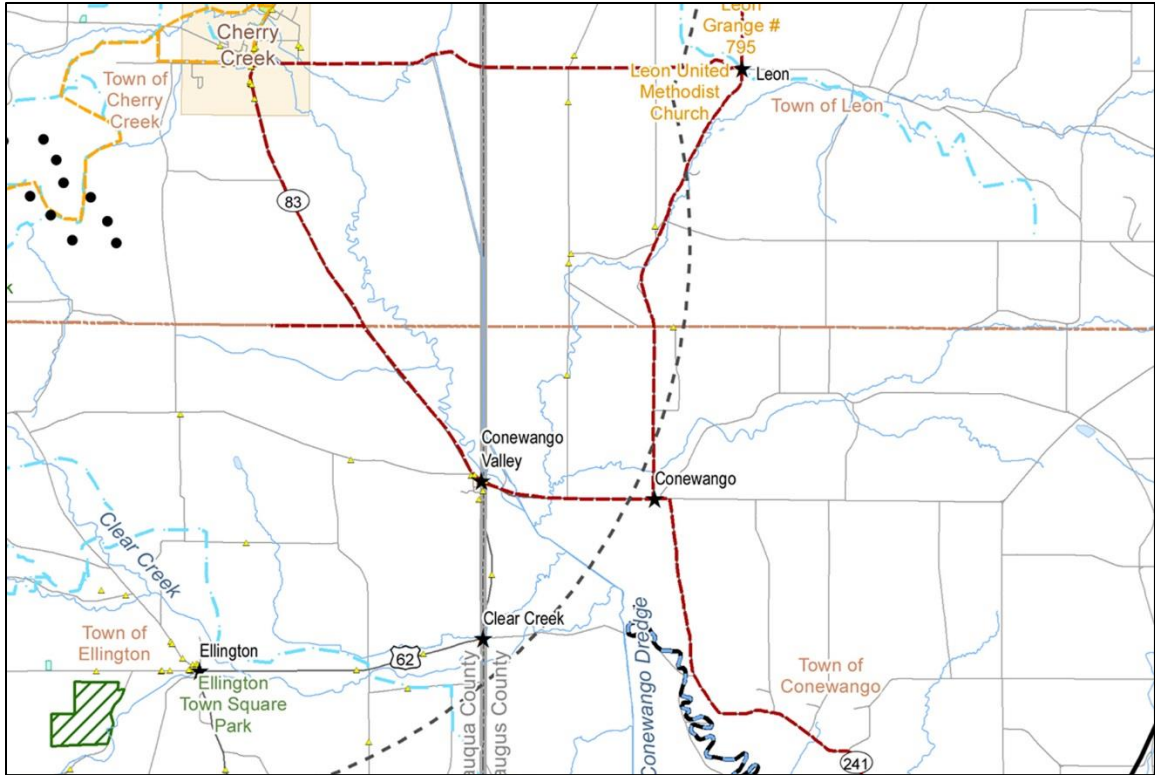
Inset 2. Map indicating the route of the Amish Trail (indicated by the red line) through the Town and Village of Cherry Creek, as well as the five-mile study area for the Facility (EDR, 2016).