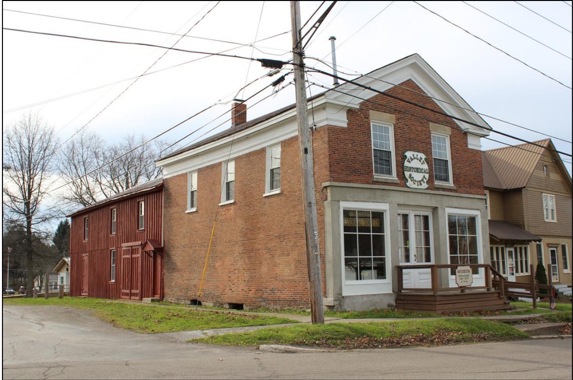
Inset 1. Valley Historical Society museum (constructed circa 1845), 36 Main Street, Village of Sinclairville, NY (EDR, 2015).

The Valley Historical Society president has indicated that the foundation of the museum building has recently begun to show signs of deterioration, and has obtained an estimate for stabilization totaling $11,400. The Valley Historical Society also indicated that the museum building will also require a new roof, and painting in the near future, which is estimated to cost up to an additional $10,000. In addition, the total costs of the annual history fair are estimated to be approximately $8,000 to $9,000.