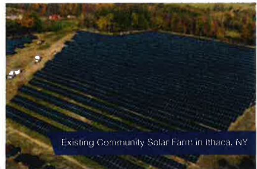
Existing Community Solar Farm in Ithaca, NY

LOCATION: Grand Island Town Hall 2255 Baseline Rd, Grand Island, NY 14072