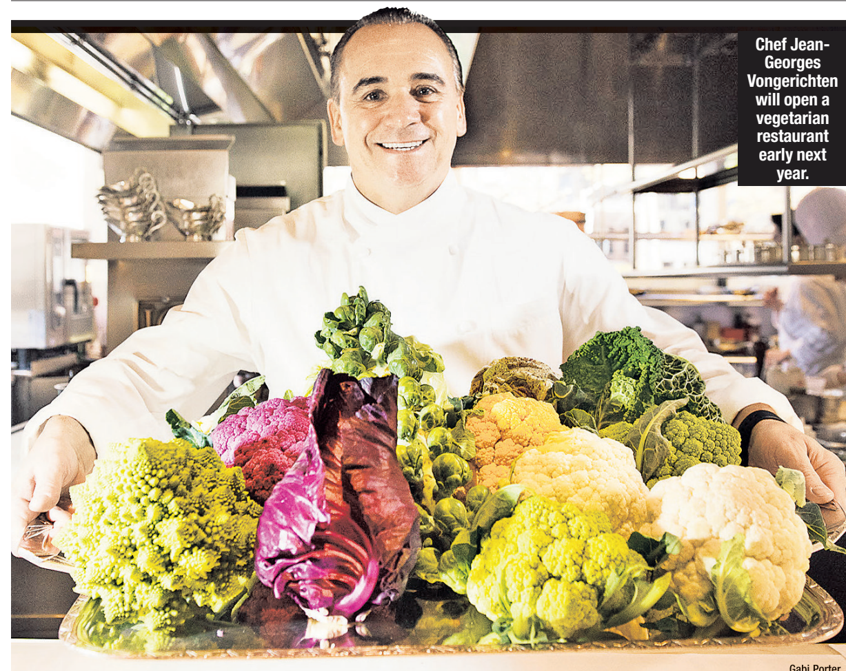
Chef Jean-Georges Vongerichten will open a vegetarian restaurant early next year.