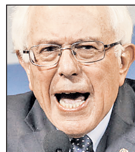
BERNIE SANDERS Eyed for "revolution."

There's another reason for Hillary Clinton to be annoyed with Mayor de Blasio: His pals at the Working Families Party endorsed Democratic rival Sen. Bernie Sanders for president on Tuesday. It's the first time the left-leaning party has taken sides in a Democratic primary for president since its formation in 1998.