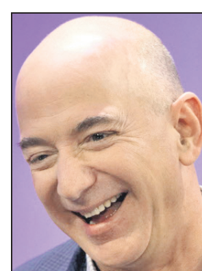
JEFF BEZOS Tough luck, Apple & Google.