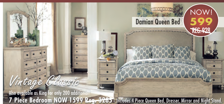
Damian Queen Bed

ALSO AVAILABLE IN SIENNA OR WALNUT. UPGRADE TO SLEEPER FOR ONLY 200 ADDITIONAL!