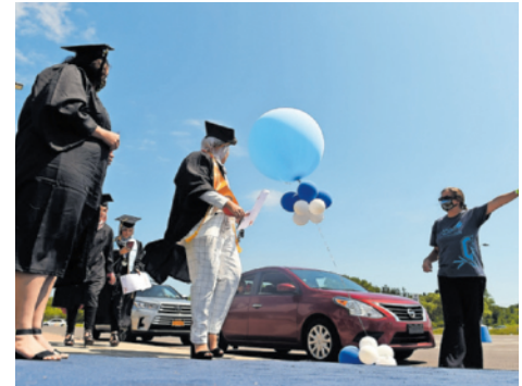
Students park and leave their vehicles. The degrees were awarded in a tent outside the SRC Arena.

Students slated to graduate from Onondaga Community College finally had their commencement ceremony Sunday on the campus in front of the SRC Arena.