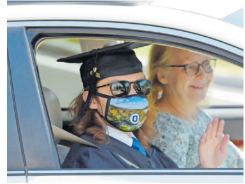
Students were driving around the OCC campus before receiving their degrees.