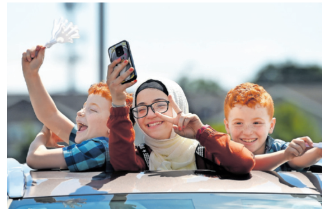
Family members cheer on the graduates.